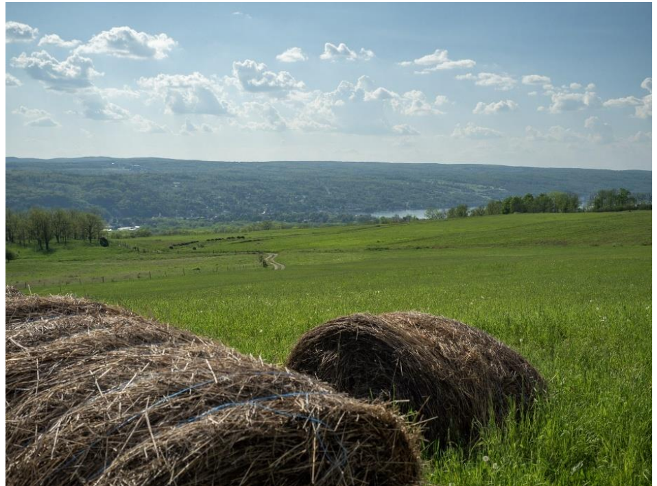
Figure 3: Forever farmland above Watkins Glen and Seneca Lake.

Before retiring a few years ago, I worked to help conserve lands important to protecting the region's beauty, water quality, farmland, habitat, and recreational opportunities, so I'm going to indulge in sharing some good news about conservation efforts around Seneca Lake. Just last weekend, our governor announced that the New York State Department of Environmental Conservation purchased the 284-acre former Babcock Hovey Scout Camp leading to the permanent protection of this property and its 2,800 feet of Seneca Lake shoreline. Further north, in the town of Fayette, the Finger Lakes Land Trust (FLLT) accepted the donation of a 30-acre property with over 1,000 feet of undeveloped shoreline to establish the Kriss Family Nature Preserve in 2022. More recently, FLLT worked in partnership with the town of Geneva to purchase 74 acres protecting the heart of Kashong Glen and more than 5,500 feet of frontage on Kashong Creek. Partnerships between the state, local farmers, and FLLT developed over years have resulted in permanent protection for some of the most important farmland in the region including some of the iconic wineries and farms visible from the lake. And, thanks to local leadership, those efforts continue.