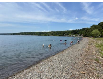
Figure 7: Lodi beach overlooking anchorage.

Saturday morning, we will head across the lake to Sapalta Restaurant at Plum Point for brunch at 11AM. They are open 10AM to noon. Land yachts can join us there also. We'll have an Anchoring / Mooring / Rafting Seminar as the ABC-FLX educational event at 1PM Saturday afternoon on the dock at Sapalta. After that, we'll set sail or motor to Miles Winery for a wine tasting on the dock. Depending on weather, boats could anchor there, at Long Point or back at Lodi on Saturday night and head home on Sunday morning.