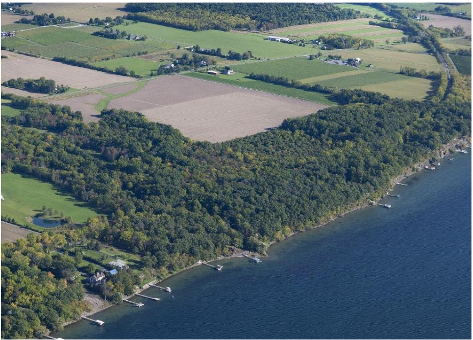
Figure 1: Protected shoreline at the Kriss Family Nature Preserve.

and mind. Since lower forces and speed are involved, there's more time for conversation and appreciating the beauty of our surroundings which Seneca Lake offers in spades.