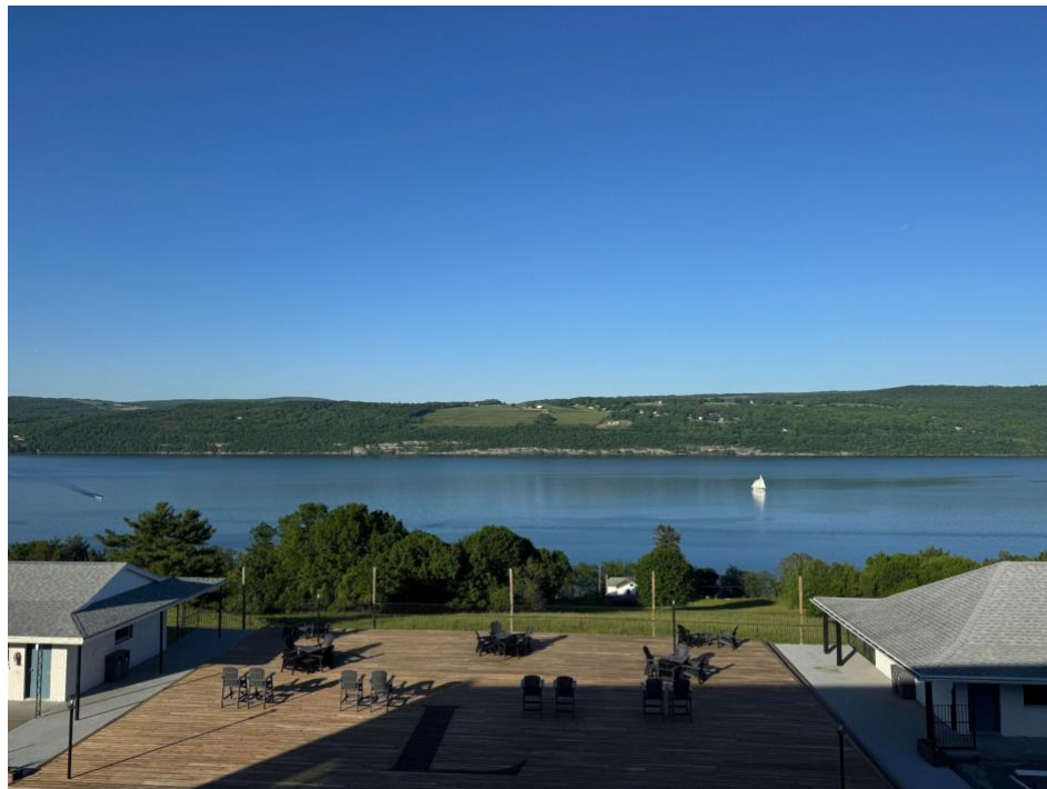
Figure 8: S/V True Love spotted from Hotel Laurel, during the June 3rd ABC-FLX event.

This year, our annual Summer Rendezvous will take place between Lodi Point State Park, Plum Point, and Miles Winery on July 31 st -August 2 nd . As many of our members recall, the Finger