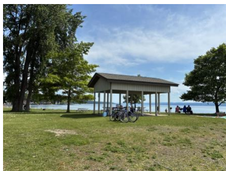
Figure 6: Lodi Point Pavilion.

At Lodi, boats can raft up in the north side anchorage area as they arrive for the afternoon and then go ashore for a pitch-in dinner at the Pavilion at 6PM. There are transient slips available near the boat ramp on the south side for