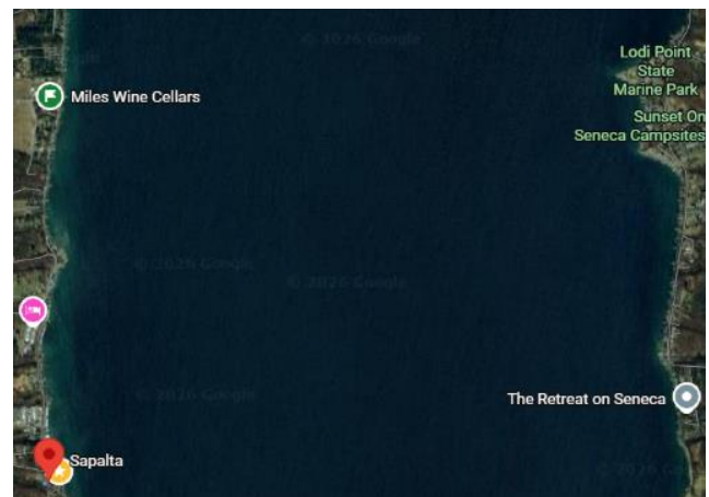
Figure 5: Miles Winery and Sapalta Restaurant are on west side.

If you are considering attending, Please RSVP to Jim McGinnis with boat name and the number in your party for Friday and Saturday by 7/15/26. I have a reservation at Sapalta for Saturday at 11AM and it will be first come first served.