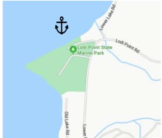
Figure 4: North side anchorage at Lodi.